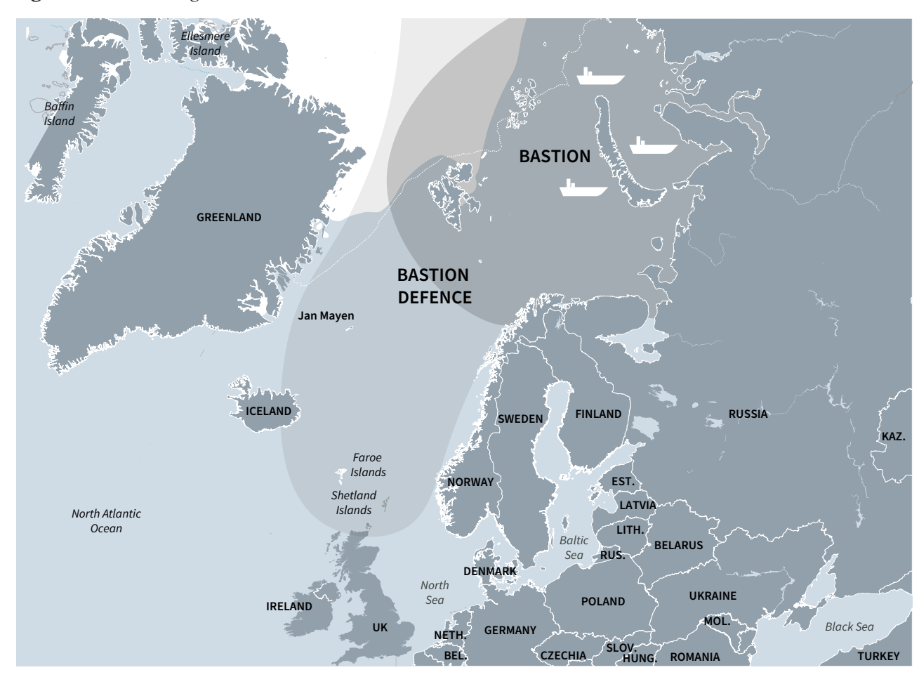
Figure 3: Russia's High North 'Bastion'