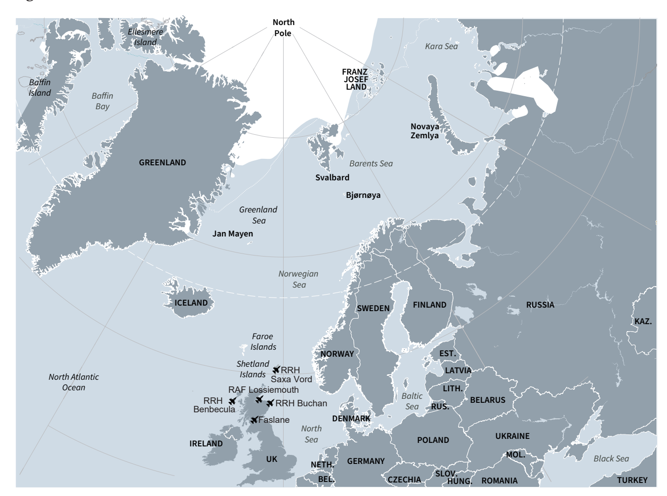
Figure 1: Bases in Scotland