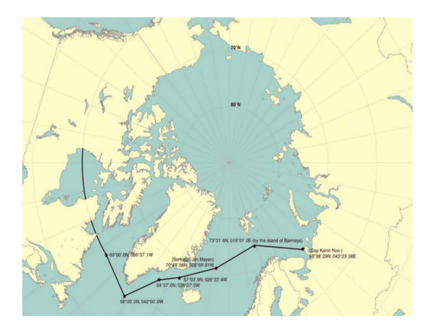
Figure 2. Geographical application of the Polar Code in the Arctic, as defined in SOLAS regulations XIV/1.3.

Source: IMO Doc. MEPC 68/21/Add.1, Annex 10.