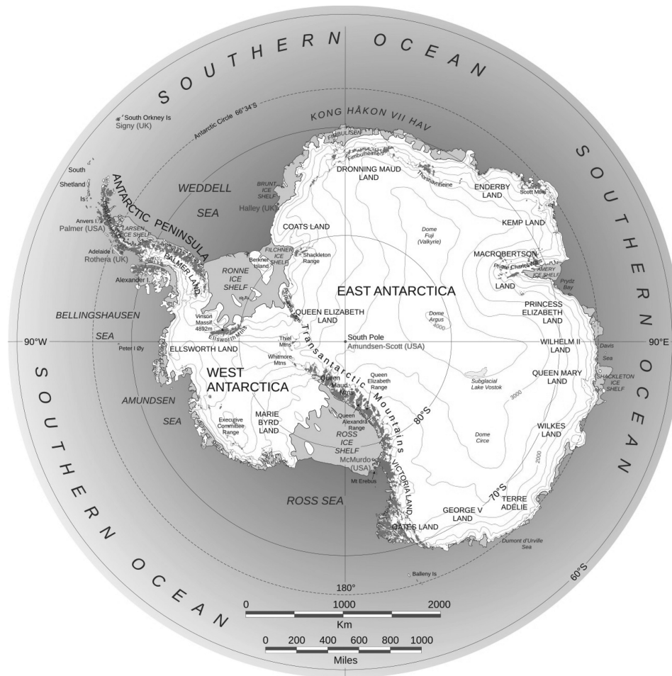
Figure 1 Major Geographical Features of Antarctica

at the turn of the nineteenth century would ‘prove themselves’. 9 The (in)famous race for the geographic South Pole was concluded in 1911, with the Norwegian explorer Roald Amundsen becoming the first to reach that point, followed a month later by the British Robert F. Scott, who perished on the return journey.